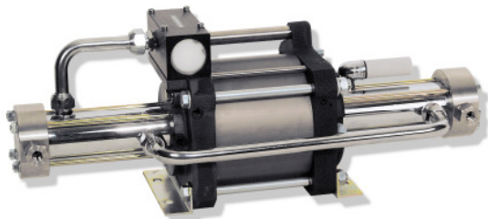
DLE 2-5 single acting, single air drive head single stage